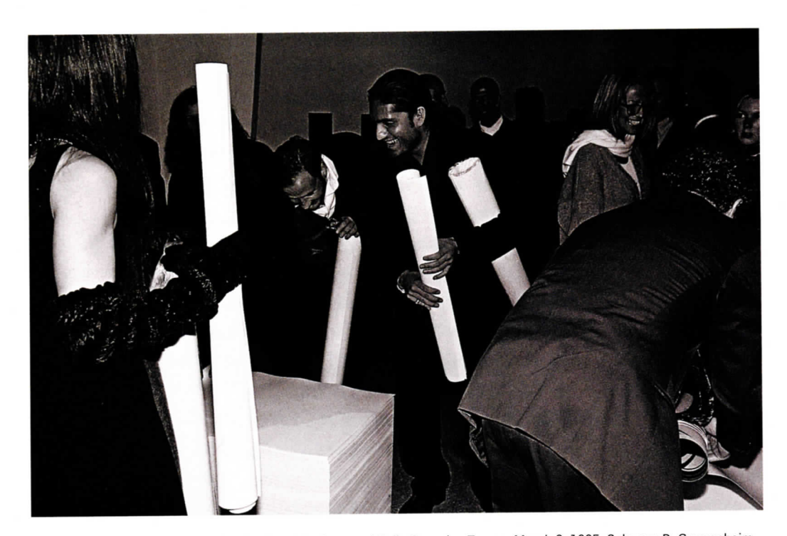
(this page and opposite) Reception for Ross Bleckner and Felix Gonzalez-Torres, March 2, 1995, Solomon R. Guggenheim Museum, New York.

issuing an invitation or a challenge, etc.)," like so many of the dematerialized artworks under consideration here that propose an action or expect a response, "always entails a kind of intrusion or even a calling into question . . . [that] inevitably contains the potentiality of a bond, an obligation."21 This possibility of a bond, an ongoing relationship of mutuality and exchange—between artist and audience, between persons—is at the heart of the anticommodification efforts. For if the economy and moral code of commodity exchange is based on alienable objects and alienated subjects, whose ties of dependence to one another are cancelled at the moment of exchange, the economy and moral code of gift giving asserts the impossibility of that cancellation. Just as the acceptance of a gift immediately puts one in debt to the gift giver, a debt that must be repaid in an appropriate and timely manner following certain cultural rules in order that one not lose face or insult the gift giver, these artworks place upon their addressees—upon us, even many years hence—a burden to answer their call for solidarity and communality.