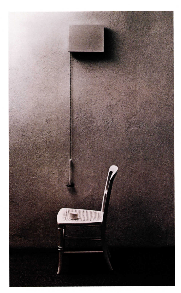
Yoko Ono, Painting to Hammer a Nail, 1966.

ship as indeed an act of critical generosity—even as an effort to democratize art, as some have argued<sup>14</sup>—then we must also attend to the full extent of the paradoxical condition that this act actualizes.